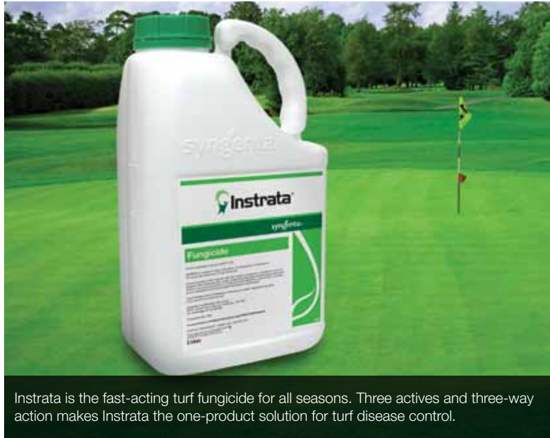
Instrata is the fast-acting turf fungicide for all seasons. Three actives and three-way action makes Instrata the one-product solution for turf disease control.